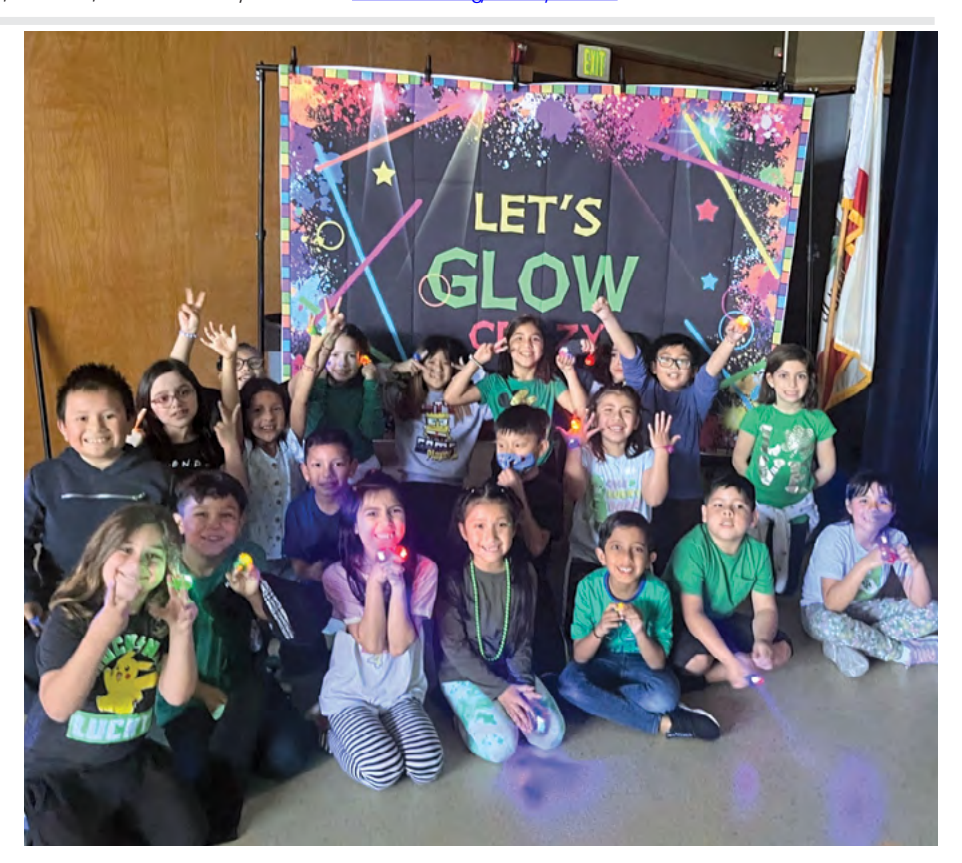
4th – 6th grade students traded in PRIDE cards to join the Upper-grade Experience. This trimester's activity was glow in the dark bowling.

After a 3-year hiatus, the Hansen Dance-a-Thon was back and bigger than ever. This school-wide fundraiser helped raise money for activities and programs that support student learning. This included assemblies and field trips. For all their hard work, each grade level was treated to a fun Glow in the Dark Dance Party, where our Hansen Huskies showed us their best dance moves. The joy on the students' faces was priceless as the music played and the students followed along to fun choreography. We sure do have some talented Huskies! We are excited to continue this wonderfully exciting opportunity and to give back to the students we serve at Hansen School.