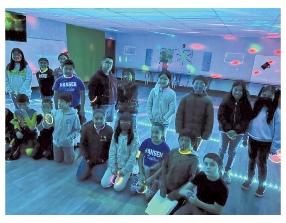
2nd grade students enjoy the Dance-a-thon's Glow in the Dark Dance Party.